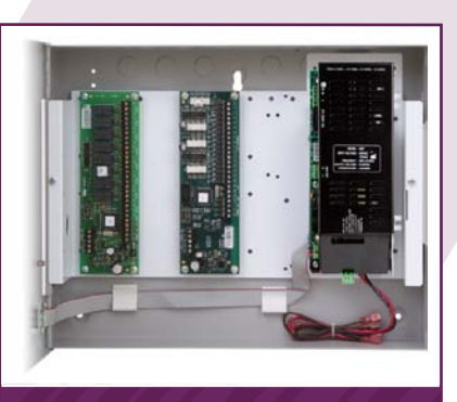
2 x I/O boards with PSU